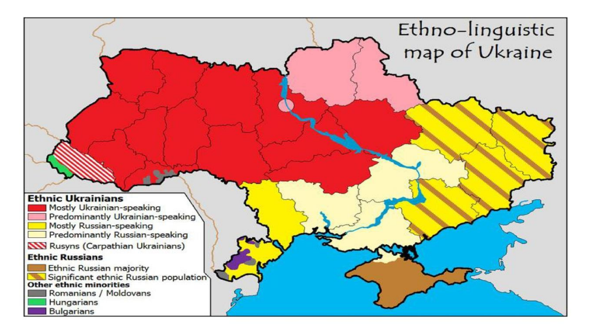
Figure 2: The ethnic diversity of Ukraine

and part speak Ukrainian. Each part has its tendencies and affiliations different from the others. (Figure 2 illustrates the ethnic diversity of Ukraine).