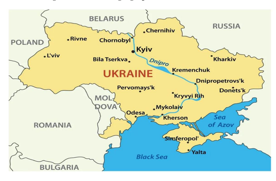
Figure 1: Shows the geographical location of Ukraine

1: The Ukrainian political system: The state of Ukraine is located in the eastern part of the continent of Europe between Russia, Belarus, Romania, Poland, Slovakia, and Moldavia. (As in Figure 1). It has views of the Black Sea and the Sea of Azov, its total area is more than 600 thousand square kilometers, and its population is more than 44 million people.<sup>1</sup>